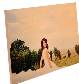
NATURAL WOOD PRINTS