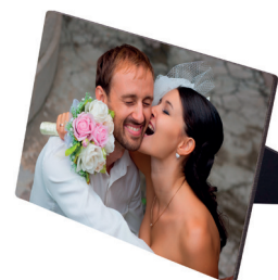
DESKTOP PHOTO PANELS